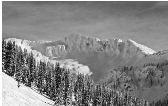
'Ymir Peak' Whitewater Ski Resort

687 Highway 3A, Nelson, BC V1L 5P4 (250) 352-6606 Room rates – 2 Queen Beds for 2 people $84.00 + tax, each additional person is $7.00 + tax. 1 Queen bed $79.00 for 2 people. All rooms equipped with mini fridge and microwave