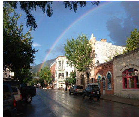
Baker Street Downtown Nelson

RCMP 1010 Second St, Nelson, BC V1L 6B6 (250) 352-2156