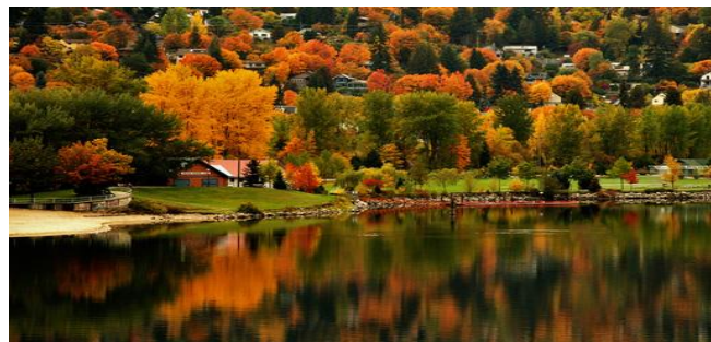
Lakeside Park Kootenay Lake (Nelson Waterfront)

The Nelson Transit System currently operates four routes in Nelson. Complete info available on the web page.