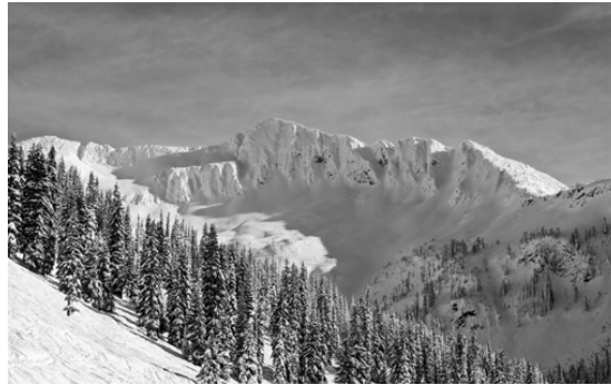
'Ymir Peak' Whitewater Ski Resort

Room rates – 2 Queen Beds for 2 people $84.00 + tax, each additional person is $7.00 + tax. 1 Queen bed $79.00 for 2 people. All rooms equipped with mini fridge and microwave