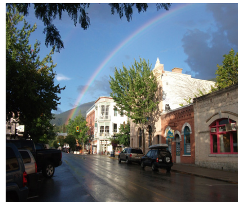
Baker Street Downtown Nelson

Kootenay Lake Medical Clinic (in Chakko Mikka Mall)