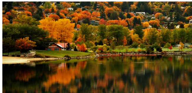
Lakeside Park Kootenay Lake (Nelson Waterfront)

Along the lakefront originating from Prestige Lakeside Resort and through Lakeside Park There are numerous trails throughout Nelson (call our Visitors centre for more info.)