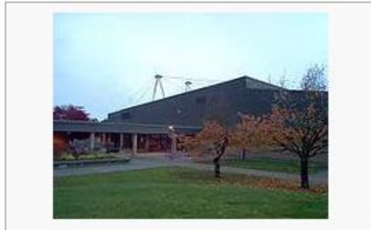
Frank Crane Arena

Frank Crane Arena is immediately adjacent the Cliff McNabb ice surface.