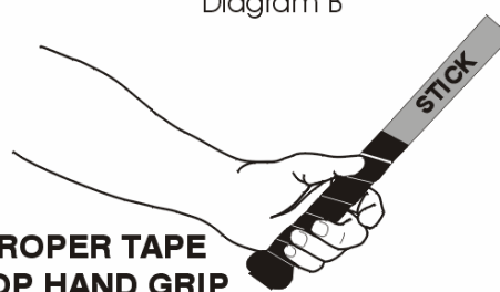
IMPROPER TAPE & TOP HAND GRIP

STICK SHOULD BE HELD WITH THE TOP HAND AS SHOWN IN DIAGRAM "A" WITH HOCKEY GLOVES ON OR OFF. THIS GRIP ALLOWS FULL MOBILITY OF THE WRIST ON THE TOP HAND. BIG TAPE KNOBS AS SHOWN IN DIAGRAM "B", WILL CAUSE A SLIGHTLY LOWER GRIP. THE PORTION OF THE STICK AND TAPE THAT PROTRUDES OUT THE BACK OF THE HAND REDUCES THE MOBILITY OF THE WRIST.